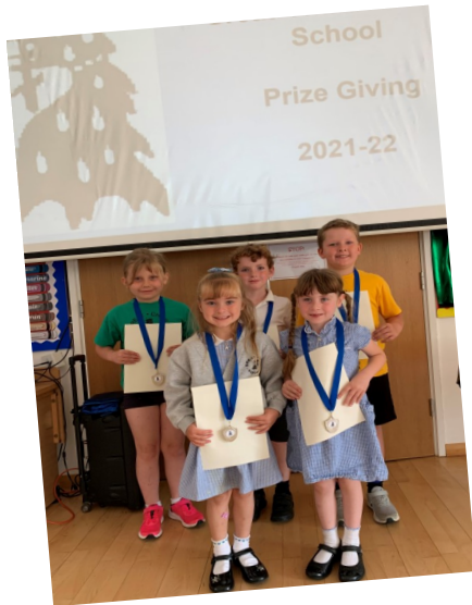
EYFS, Year 1 and Year 2 Values Award Winners

Congratulations to the following children for all of their hard work and achievements. Keep up the great work!