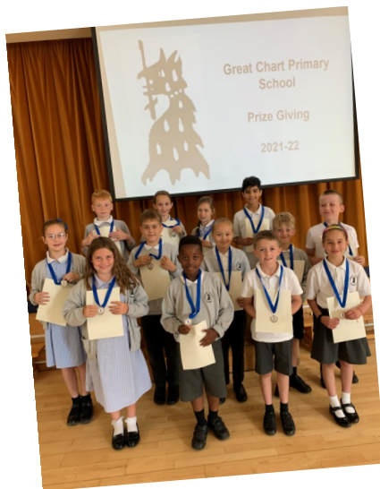
Years 3 to 5 Progress & Achievement Award Winners