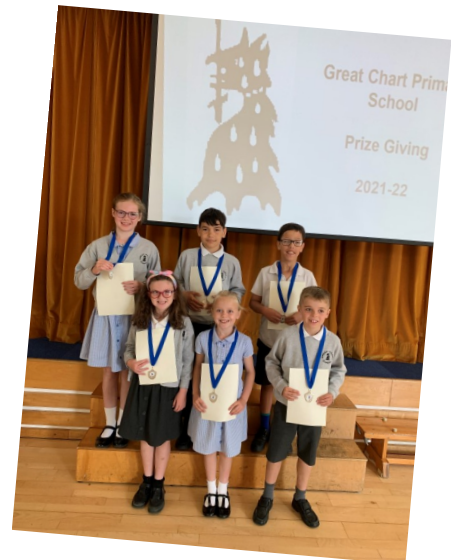
Years 3 to 5 School Values Award Winners