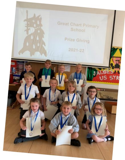
EYFS, Year 1 and Year 2 Achievement Award Winners